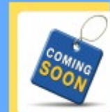
New Clinician Branford #012B